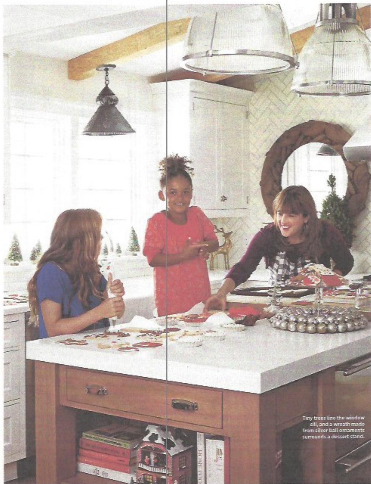
Tiny trees line the window sill, and a wreath made from silver ball ornaments surrounds a dessert stand.

"The kitchen is Christmas central," says Katie, "where we bake cookies for the grandparents and, of course, Santa."