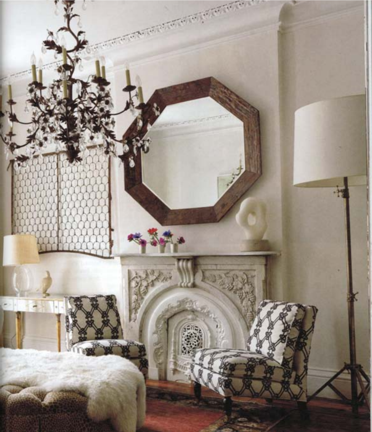
DOWN TO EARTH IN HER CARROLL GARDENS FAMILY HOME